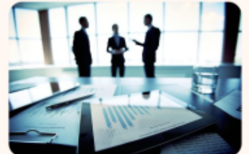
SCREENING & ASSESSMENT