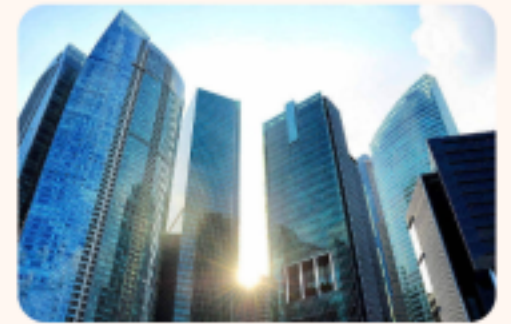
RECRUITER ON DEMAND